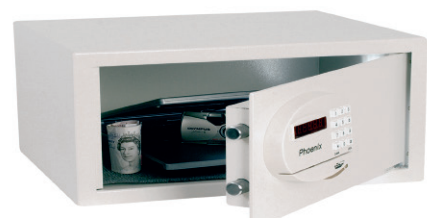
Saracen SS0936E Laptop Safe