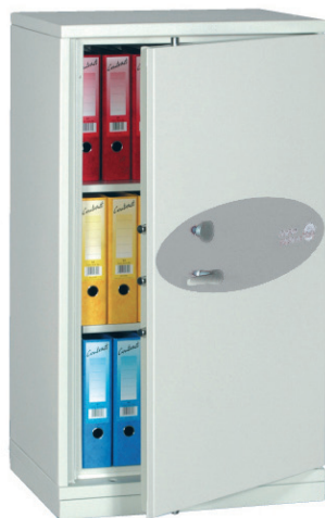
Fire Ranger FS1511K