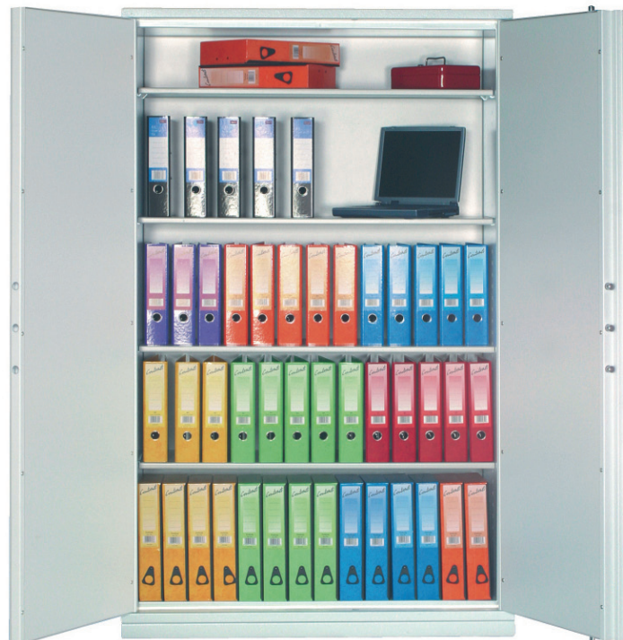
Fire Ranger FS1513K